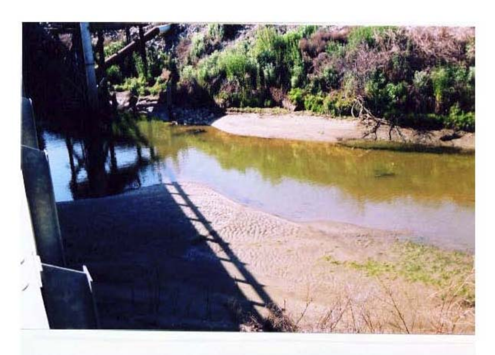
Middle River Undine Bridge 4/1/07 4:00 p.m.